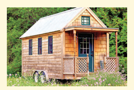
Recent applications to the Island Loan Fund are for non-traditional homes, like tiny houses.

The original goal was to help islanders purchase existing houses, but by the time the Island Loan Fund was launched, the real estate market had rebounded from the