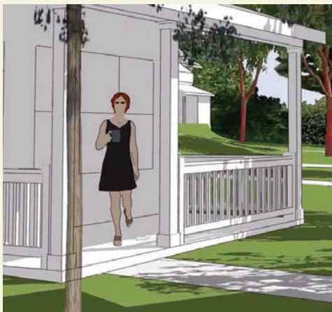
At right, location of new homeownership project. Above, project is currently in the design stage.

In 2020 April's Grove was completed offering 45 rental homes to residents. OPAL now has 110 home ownership properties and 82 rental homes.