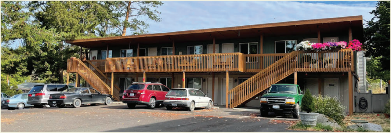
The Northern Heights Apartments.