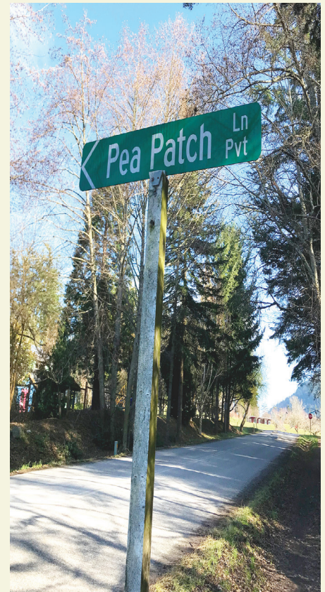
The Pea Patch Lane property is located right in Eastsound Village, between the fire station and Enchanted Forest Road. (See graphic on the opposite page.)