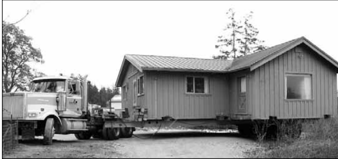
Baker house arrives at Oberon Meadow.

OPAL's building committee and staff determined that the western part of the Oberon Wood plat would be a suitable location with some minor modifications. The next piece of the puzzle fell into place when Adam Greve of Nickel Bros., the only house