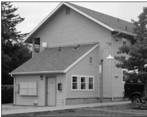
The office at Lavender Hollow apartments