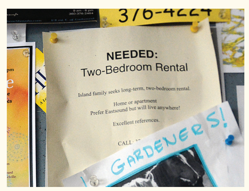
The need for rental housing is widespread and has broad impacts.

very evident that the problem was much more widespread and had much broader impacts: employers in the construction, tourism, healthcare, home maintenance, public safety, utilities and education sectors all were – and still are – constrained by the lack of qualified, long-term employees. They are unable to meet the demand for their products and services because their prospective employees literally cannot locate housing on Orcas that they can afford. Current employees are at risk of losing their housing because landlords could raise rents, or convert the properties to vacation rentals.