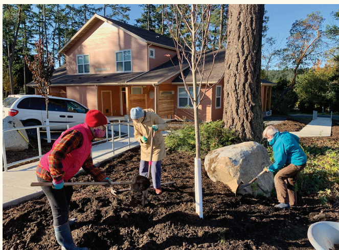
Volunteers collaborate on a landscaping project at April's Grove.

In the face of hardships, Orcas Islanders rallied to ease neighbors' burdens. That web of support was born out of trust in one another. Trust that enabled us to collaborate quickly and with compassion as our guide.