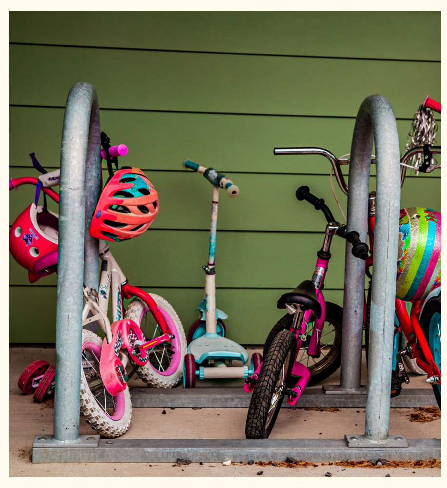
Colorful signs of home: Bikes parked at April's Grove show how OPAL neighborhoods make space for families to grow and thrive.

Thanks to your support, nearly 8% of the year-round population of the island lives in an OPAL home. Our island just would not be the same without any one of you.