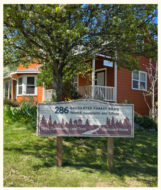
In 2024, OPAL was back designing and building neighborhoods and homes and supporting the people who live in those homes.

In April, architects from Environmental Works led a series of community design workshops that generated a plethora of ideas, many of which