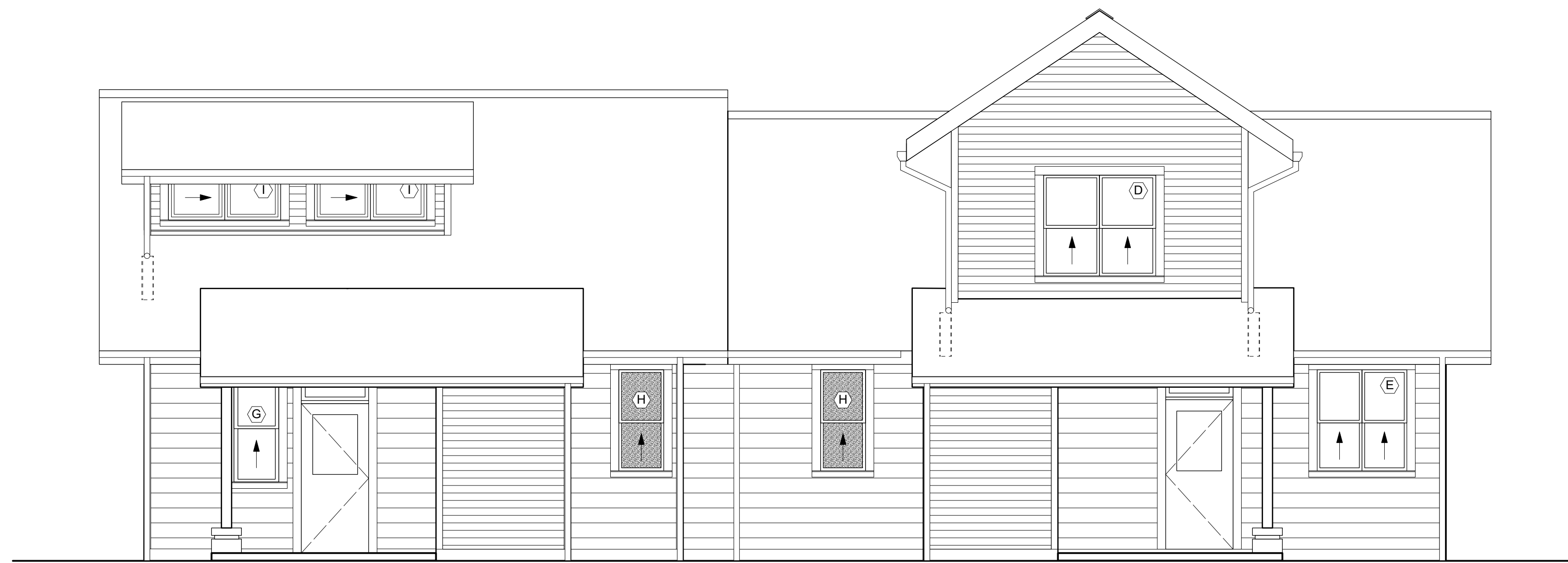
1-BEDROOM + LOFT HOME